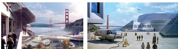
Star Trek had its 50th anniversary in 2016, the same year Apple Park's construction began; a building larger than the Pentagon that looks like an early stage of the Starship Enterprise saucer.

In the Star Trek vision of our future, when the capital of America on the right coast is replaced by the capital of Starfleet on the left, there is finally peace on Earth and a global country to celebrate. Perhaps there is something in this symbolism we should take to heart.